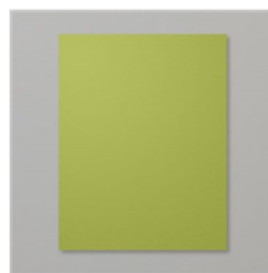
Old Olive 8-1/2" X 11" Cardstock - 100702