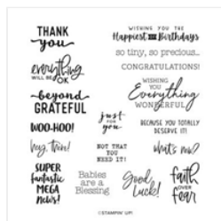
Charming Sentiments Photopolymer Stamp Set (English) - 159985