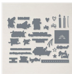
Sentiment Silhouettes Dies - 158733