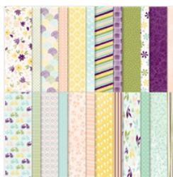
Design A Daydream 12" X 12" (30.5 X 30.5 Cm) Host Designer Series Paper - 159161