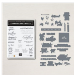
Charming Sentiments Bundle (English) - 158734

Mary Fish stampinpretty@gmail.com http://stampinpretty.com