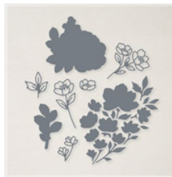
Cottage Flowers Dies - 159047