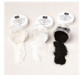
Basics Embossing Powders - 155554