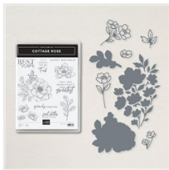
Cottage Rose Bundle (English) - 159048

Mary Fish stampinpretty@gmail.com http://stampinpretty.com