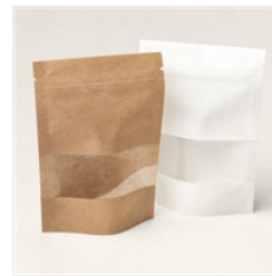
Peekaboo Treat Bags - 159252