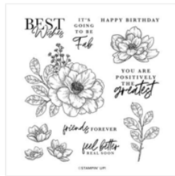
Cottage Rose Cling Stamp Set (English) - 159040