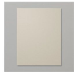
Sahara Sand 8-1/2" X 11" Cardstock - 121043