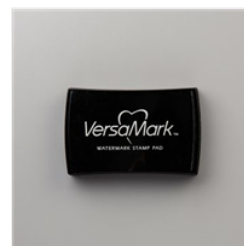
Versamark Pad - 102283