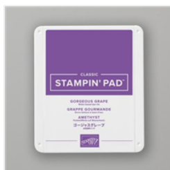
Gorgeous Grape Classic Stampin' Pad - 147099