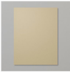
Crumb Cake 8-1/2" X 11" Cardstock - 120953

Mary Fish stampinpretty@gmail.com http://stampinpretty.com