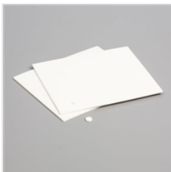
Mini Stampin' Dimensionals - 144108