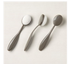
Blending Brushes - 153611