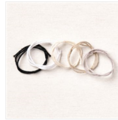
Baker's Twine Essentials Pack - 155475