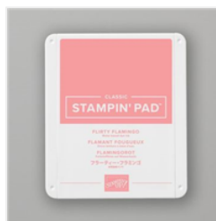
Flirty Flamingo Classic Stampin' Pad - 147052