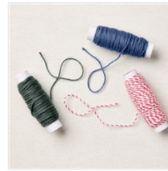
Fan Bakers Twine - 158143