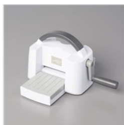
Mini Stampin' Cut & Emboss Machine - 150673