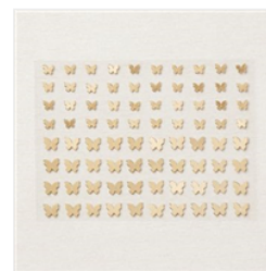
Brushed Brass Butterflies - 158136