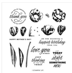
Flowering Tulips Photopolymer Stamp Set (English) - 157672