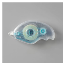
Stampin' Seal - 152813