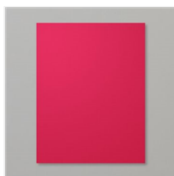
Real Red 8-1/2" X 11" Cardstock - 102482