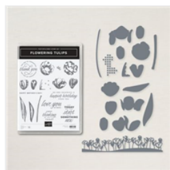
Flowering Tulips Bundle (English) - 157678