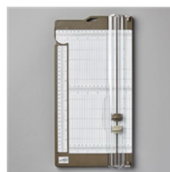
Paper Trimmer - 152392