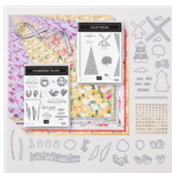
Flowering Fields Suite Collection (English) - 157685

Mary Fish stampinpretty@gmail.com http://stampinpretty.com