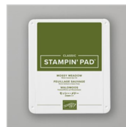
Mossy Meadow Classic Stampin' Pad - 147111