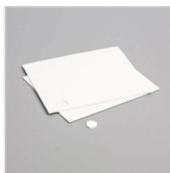
Stampin' Dimensionals - 104430