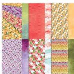
Flowering Fields 12" X 12" (30.5 X 30.5 Cm) Designer Series Paper - 157670