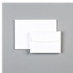
Basic White Note Cards & Envelopes - 159232