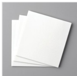
Foam Adhesive Sheets - 152815