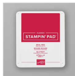
Real Red Classic Stampin' Pad - 147084