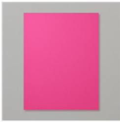
Melon Mambo 8-1/2" X 11" Cardstock - 115320

Mary Fish stampinpretty@gmail.com http://stampinpretty.com