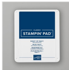
Night Of Navy Classic Stampin' Pad - 147110