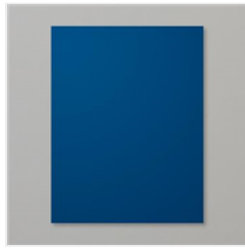
Night Of Navy 8-1/2" X 11" Cardstock - 100867