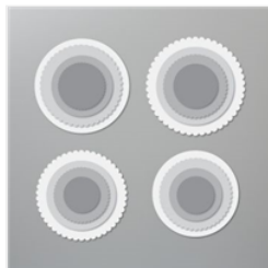
Layering Circles Dies - 151770