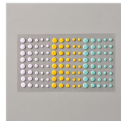
Playing With Patterns Resin Dots - 152467