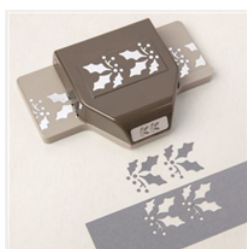
Holly Border Punch - 156379