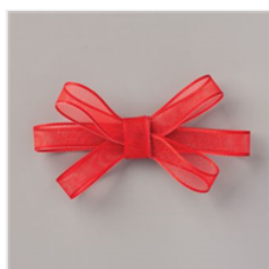
Real Red 3/8" (1 Cm) Sheer Ribbon - 153535