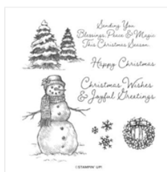
Snow Wonder Cling Stamp Set (English) - 153344