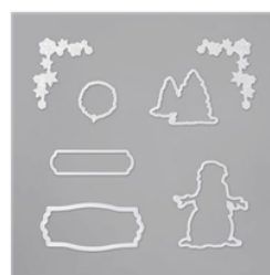
Snow Time Dies - 153564