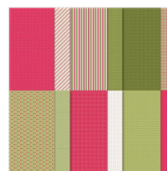
Heartwarming Hugs Designer Series Paper - 153492