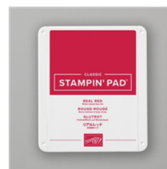
Real Red Classic Stampin' Pad - 147084