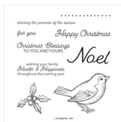
Happy Holly-Days Cling Stamp Set (English) - 156342

Mary Fish stampinpretty@gmail.com http://stampinpretty.com