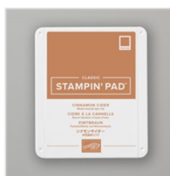
Cinnamon Cider Classic Stampin' Pad - 153114