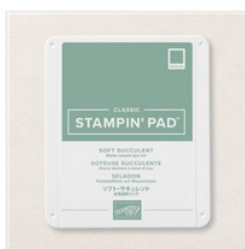
Soft Succulent Classic Stampin' Pad - 155778