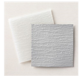
Bark 3D Embossing Folder - 155431