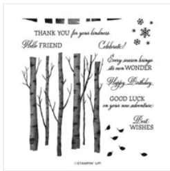
Welcoming Woods Photopolymer Stamp Set - 156550