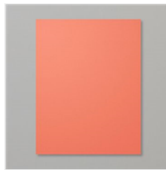
Calypso Coral 8-1/2" X 11" Cardstock - 122925