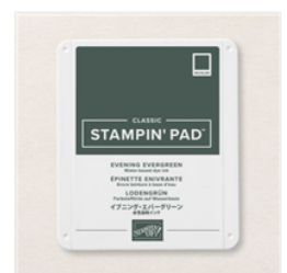
Evening Evergreen Classic Stampin' Pad - 155576