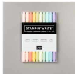
Subtles Stampin' Write Markers - 147156