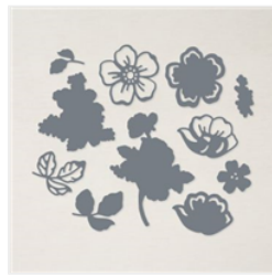
Summer Shadows Dies - 156618