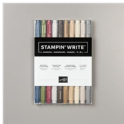
Neutrals Stampin' Write Markers - 147158