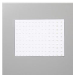
Pearl Basic Jewels - 144219