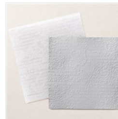
Timeworn Type 3D Embossing Folder - 156505