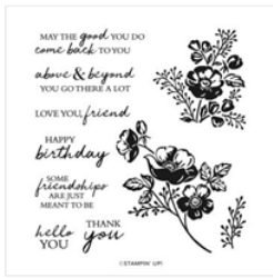
Shaded Summer Cling Stamp Set - 155783

Mary Fish mary@stampinpretty.com http://stampinpretty.com