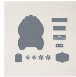
Pretty Pillowbox Dies - 156321