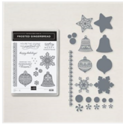
Frosted Gingerbread Bundle (English) - 156807

Mary Fish mary@stampinpretty.com http://stampinpretty.com