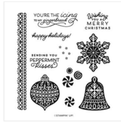
Frosted Gingerbread Photopolymer Stamp Set (English) - 156314