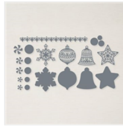
Gingerbread Dies - 156320