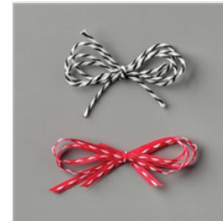
Playful Pets Trim Combo Pack - 152466