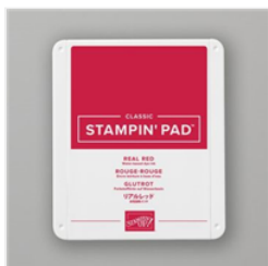
Real Red Classic Stampin' Pad - 147084