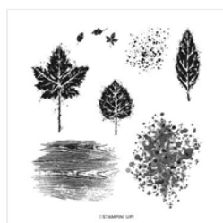
Gorgeous Leaves Cling Stamp Set - 153365