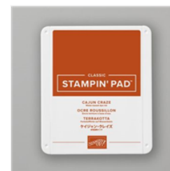
Cajun Craze Classic Stampin' Pad - 147085