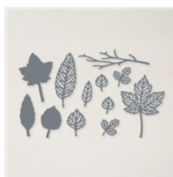
Intricate Leaves Dies - 153566