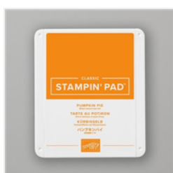
Pumpkin Pie Classic Stampin' Pad - 147086