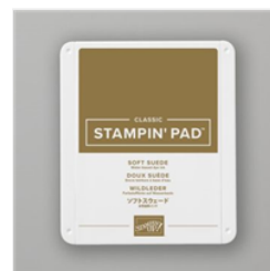
Soft Suede Classic Stampin' Pad - 147115