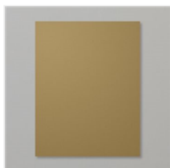
Soft Suede 8-1/2" X 11" Cardstock - 115318