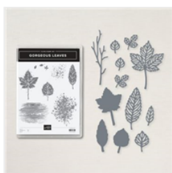
Gorgeous Leaves Bundle - 158609