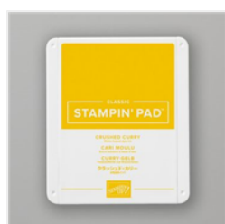
Crushed Curry Classic Stampin' Pad - 147087