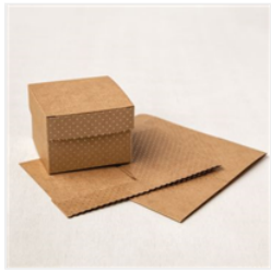
Scalloped Kraft Treat Boxes - 155481