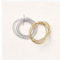
Simply Elegant Trim - 155766