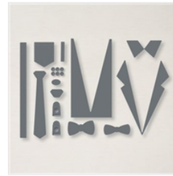
Suit & Tie Dies - 154322