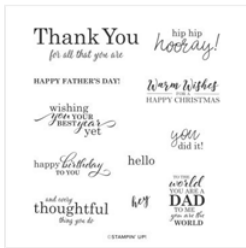
Best Year Cling Stamp Set (En) - 152568