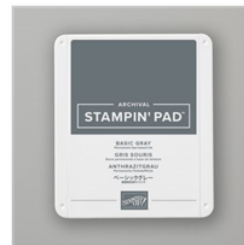
Basic Gray Classic Stampin' Pad - 149165