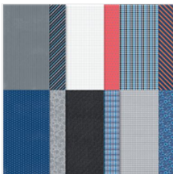
Well Suited 12" X 12" (30.5 X 30.5 Cm) Designer Series Paper - 154562