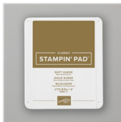
Soft Suede Classic Stampin' Pad - 147115