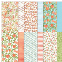
You're A Peach 12" X 12" (30.5 X 30.5 Cm) Designer Series Paper - 155686