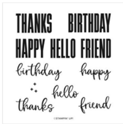
Biggest Wish Photopolymer Stamp Set (English) - 155052

Mary Fish mary@stampinpretty.com http://stampinpretty.com