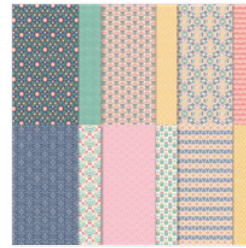
Sweet Symmetry 12" X 12" (30.5 X 30.5 Cm) Designer Series Paper - 155605