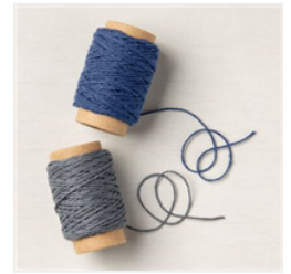
Well Suited Twine Combo Pack - 154566