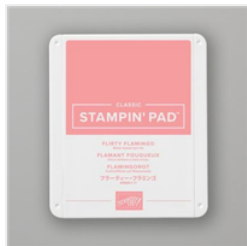
Flirty Flamingo Classic Stampin' Pad - 147052