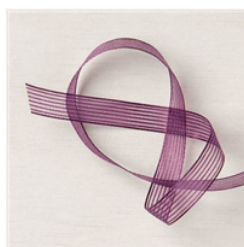
Blackberry Bliss Striped Ribbon - 154569