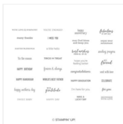
Itty Bitty Greetings Cling Stamp Set (En) - 151331

Mary Fish mary@stampinpretty.com http://stampinpretty.com