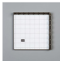
Stamaparatus - 146276