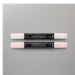
Petal Pink Stampin' Blends Combo Pack - 154893