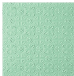
Tin Tile 3D Embossing Folder - 151801