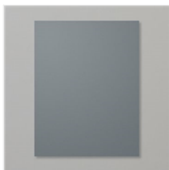
Basic Gray 8-1/2" X 11" Cardstock - 121044