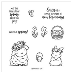
Springtime Joy Cling Stamp Set - 154403