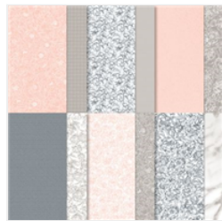
Peony Garden Designer Series Paper - 152483