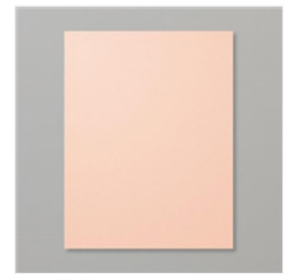
Petal Pink 8-1/2" X 11" Cardstock - 146985