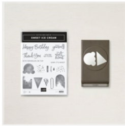
Sweet Ice Cream Bundle (English) - 156244

Mary Fish mary@stampinpretty.com http://stampinpretty.com