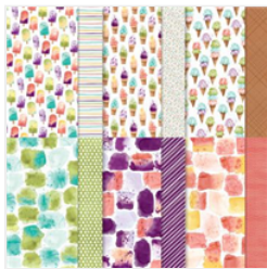
Ice Cream Corner Designer Series Paper - 154567