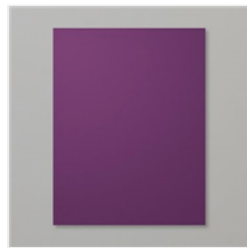
Blackberry Bliss 8-1/2" X 11" Cardstock - 133675