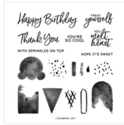
Sweet Ice Cream Photopolymer Stamp Set - 154456