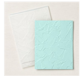
Painted Texture 3D Embossing Folder - 154317