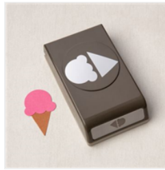
Ice Cream Cone Builder Punch - 154241