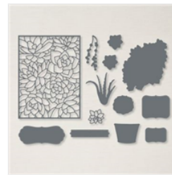
Potted Succulents Dies - 154330