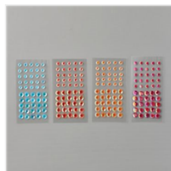
Artistry Blooms Adhesive-Backed Sequins - 152477