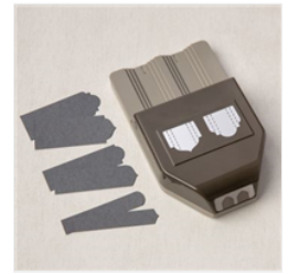
Treasured Tags Pick A Punch - 154425