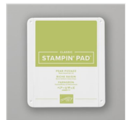
Pear Pizzazz Classic Stampin' Pad - 147104