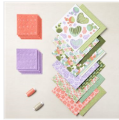
Flowering Cactus Product Medley Refill - 155400