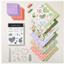
Flowering Cactus Product Medley - 154559