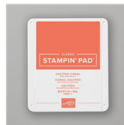
Calyпсо Coral Classic Stampin' Pad - 147101