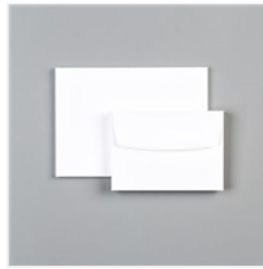
Basic White Note Cards & Envelopes - 159232