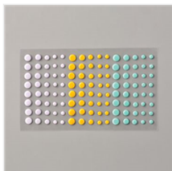
Playing With Patterns Resin Dots - 152467