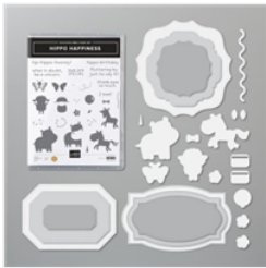
Hippo Happiness Bundle (En) - 154080