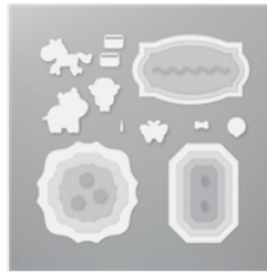
Hippo & Friends Dies - 153585