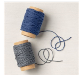
Well Suited Twine Combo Pack - 154566