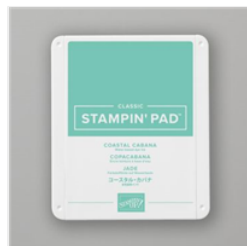
Coastal Cabana Classic Stampin' Pad - 147097