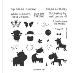
Hippo Happiness Photopolymer Stamp Set (En) - 152644