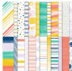
Playing With Patterns 6" X 6" (15.2 X 15.2 Cm) Designer Series Paper - 152490