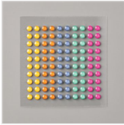
2020-2022 In Color Enamel Dots - 152480