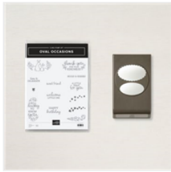
Oval Occasions Bundle (English) - 156261

Mary Fish mary@stampinpretty.com http://stampinpretty.com