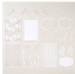
Dandy Laser-Cut Paper - 154300