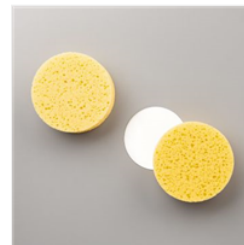
Stamping Sponges - 141337