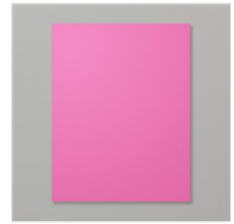
Magenta Madness 8-1/2 X 11 inch Cardstock - 153080