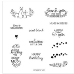
Oval Occasions Stamp Set - 154477