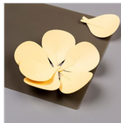
Silicone Craft Sheet - 127853