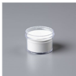
White Stampin' Emboss Powder - 109132