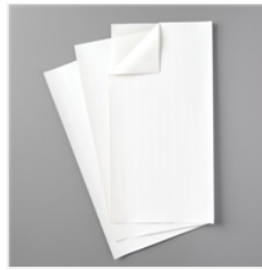
Adhesive Sheets - 152334