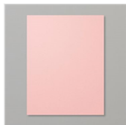
Blushing Bride 8-1/2" X 11" Cardstock - 131198