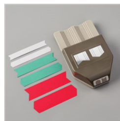
Banners Pick A Punch - 153608