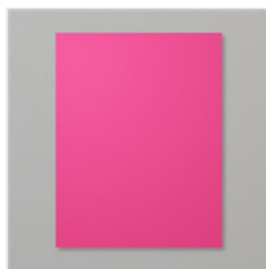
Melon Mambo 8-1/2" X 11" Cardstock - 115320