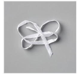
Whisper White 1/4" (6.4 Mm) Crinkled Seam Binding Ribbon - 151326