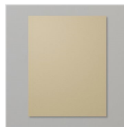
Crumb Cake 8-1/2" X 11" Cardstock - 120953