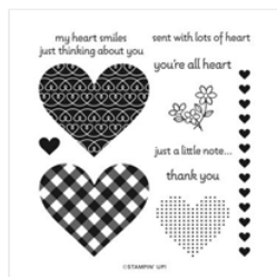
Lots Of Heart Photopolymer Stamp Set - 154348