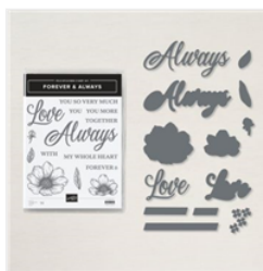
Forever And Always Bundle - 156200