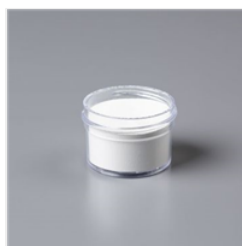
White Stampin' Emboss Powder - 109132