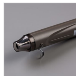
Heat Tool - 129053