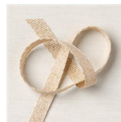
3/8" (1 Cm) Fine Art Ribbon - 154561