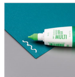
Multipurpose Liquid Glue - 110755