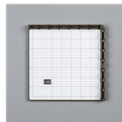
Stamparatus - 146276