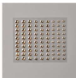
Gilded Gems - 152478