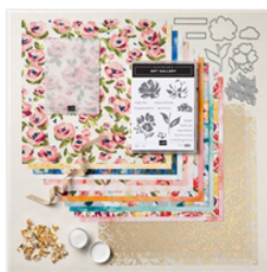
Fine Art Floral Suite Collection - 155982