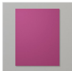
Rich Razzleberry 8-1/2" X 11" Cardstock - 115316