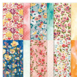
Fine Art Floral 12" X 12" (30.5 X 30.5 Cm) Designer Series Paper - 154558