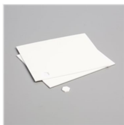
Stampin' Dimensionals - 104430