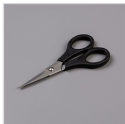
Paper Snips Scissors - 103579