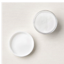
Heat & Stick Powder - 156110