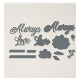
Always Dies - 154307