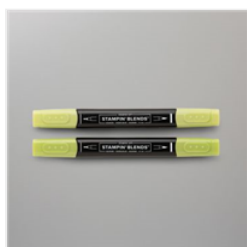
Granny Apple Stampin' Blends Combo Pack - 154885