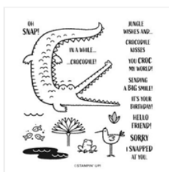
Oh Snap Photopolymer Stamp Set - 154486