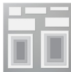
Rectangle Stitched Dies - 151820