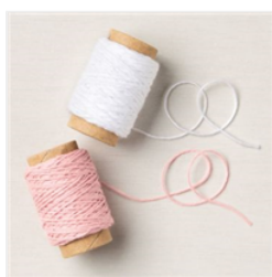
Snail Mail Twine Combo Pack - 154579