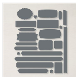
Messages Die - 154422