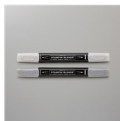
Smoky Slate Stampin' Blends Combo Pack - 154904