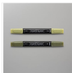
Mossy Meadow Stampin' Blends Combo Pack - 154890