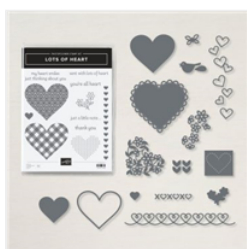
Lots of Heart Bundle (English) - 156202