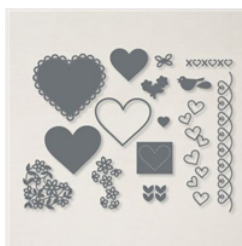
Many Hearts Dies - 154308