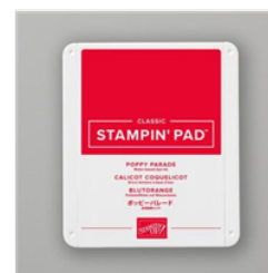
Poppy Parade Classic Stampin' Pad - 147050