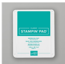
Bermuda Bay Classic Stampin' Pad - 147096