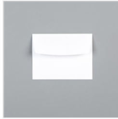
Basic White Medium Envelopes - 159236