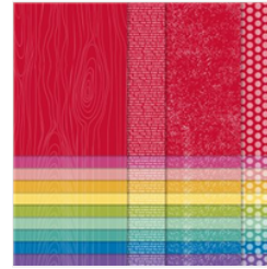
Brights 6" X 6" (15.2 X 15.2 Cm) Designer Series Paper - 152487