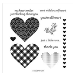
Lots of Heart Photopolymer Stamp Set - 154348