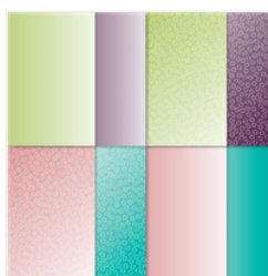
Oh So Ombre 6" X 6" (15.2 X 15.2 Cm) Designer Series Paper - 155225