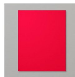
Poppy Parade 8-1/2" X 11" Cardstock - 119793