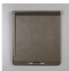
Simply Scored Scoring Tool - 122334