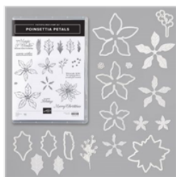
Poinsettia Petals Bundle (English) - 155148