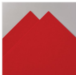
Red Velvet Paper - 153490