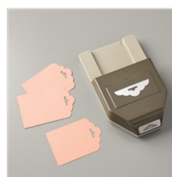
Scalloped Tag Topper Punch - 133324