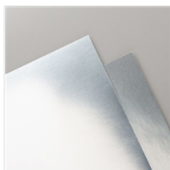
Silver Foil Sheets - 132178