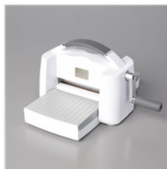
Stampin' Cut & Emboss Machine - 149653