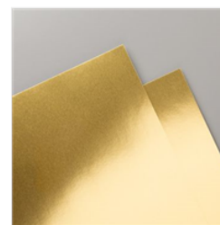
Gold Foil Sheets - 132622