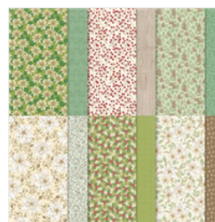
Poinsettia Place Designer Series Paper - 153487