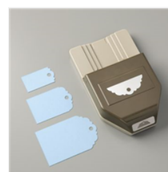
Delightful Tag Topper Punch - 149518