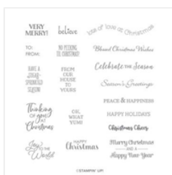
Itty Bitty Christmas Cling Stamp Set (En) - 150513