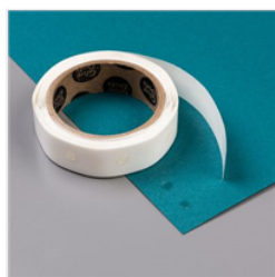
Glue Dots - 103683