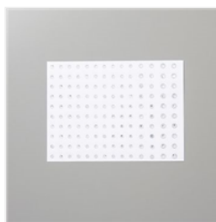
Rhinstone Basic Jewels - 144220