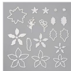
Poinsettia Dies - 153522