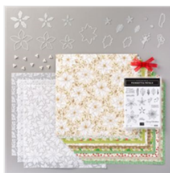
Poinsettia Place Suite Collection (English) - 155109