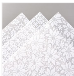
Plush Poinsettia Specialty Paper - 153486