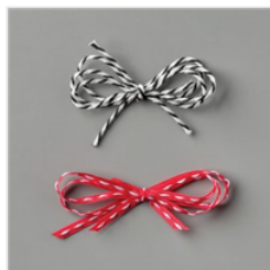
Playful Pets Trim Combo Pack - 152466