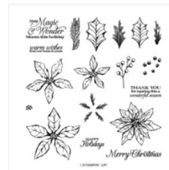
Poinsettia Petals Photopolymer Stamp Set (English) - 153475