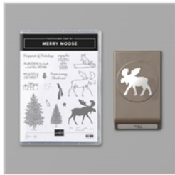
Merry Moose Bundle - 153015

Mary Fish mary@stampinpretty.com http://stampinpretty.com