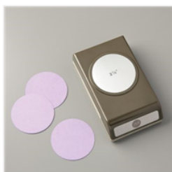
2-1/4" (5.7 Cm) Circle Punch - 143720