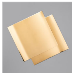
Brass Foil Sheets - 153057