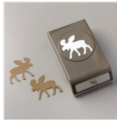
Moose Punch - 150652