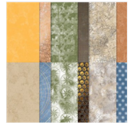
World Of Good Specialty Designer Series Paper - 152491