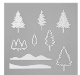
Pine Woods Dies - 153563