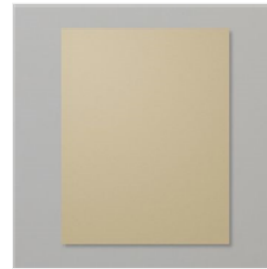
Crumb Cake 8-1/2" X 11" Cardstock - 120953