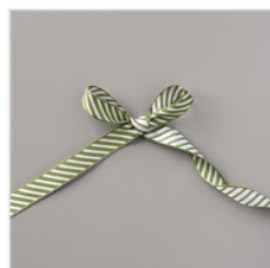
Mossy Meadow 3/8" (1 Cm) Diagonal Stripe Ribbon - 153542