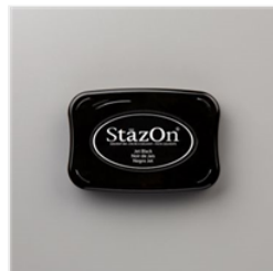
Jet Black Stazon Pad - 101406