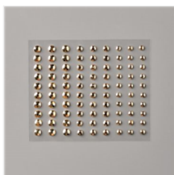
Gilded Gems - 152478