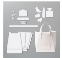
All Dressed Up Dies - 151665