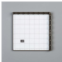
Stamparatus - 146276