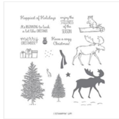
Merry Moose Photopolymer Stamp Set - 150494