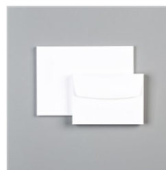
Whisper White Note Cards & Envelopes - 131527