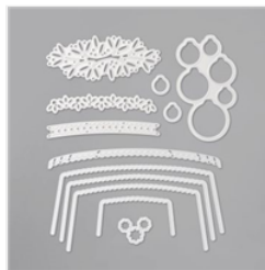
Envelopes Dies - 153531