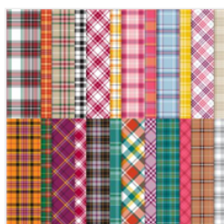
Plaid Tidings 6" X 6" (15.2 X 15.2 Cm) Designer Series Paper - 153527