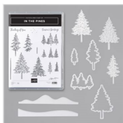
In The Pines Bundle - 155182