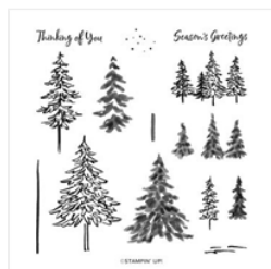
In The Pines Photopolymer Stamp Set - 153448