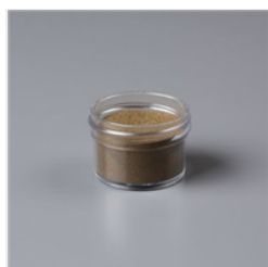
Gold Stampin' Emboss Powder - 109129