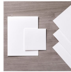
Whisper White 8-1/2" X 11" Thick Cardstock - 140272