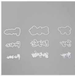
Joy Dies - 153530