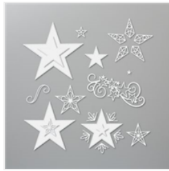
Stitched Stars Dies - 150653