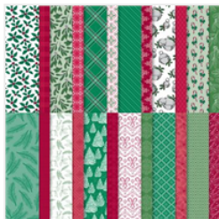
'Tis The Season 6\"/>