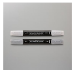
Smoky Slate Stampin' Blends Combo Pack - 154904