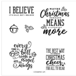
Christmas Means More Photopolymer Stamp Set - 154730