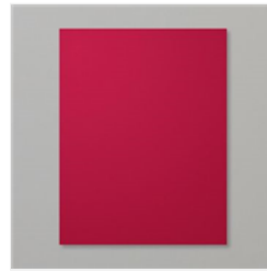
Cherry Cobbler 8-1/2\"/>