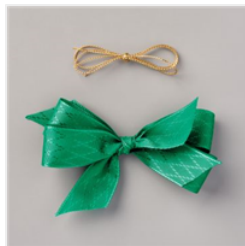
Wonder Of The Season Ribbon Combo Pack - 153537