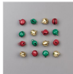
Jingle Bells - 149598