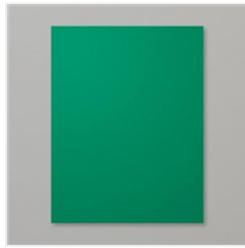
Shaded Spruce 8-1/2\"/>