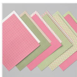
Heartwarming Hugs Designer Series Paper - 153492