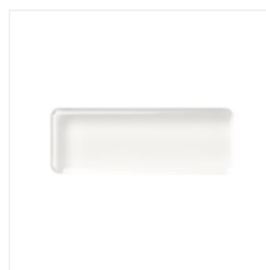
Clear Block H - 118490