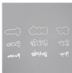
Joy Dies - 153530