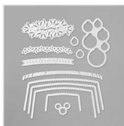
Envelopes Dies - 153531