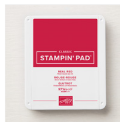
Real Red Classic Stampin' Pad - 147084