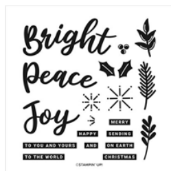
Peace & Joy Photopolymer Stamp Set - 153430