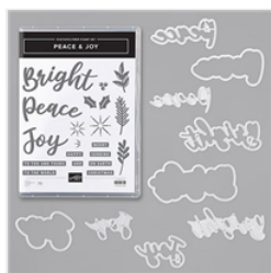
Peace & Joy Bundle - 155167