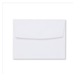
Whisper White Medium Envelopes - 107301