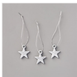
Glitter Star Ornaments - 153543