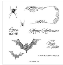
Hallows Night Magic Cling Stamp Set - 153356