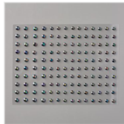
Iridescent Pearls - 153549