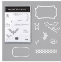
Hallows Night Magic Bundle - 155188