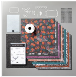
Magic In This Night Suite Collection - 155122

Mary Fish mary@stampinpretty.com http://stampinpretty.com