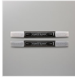
Smoky Slate Stampin' Blends Combo Pack - 154904