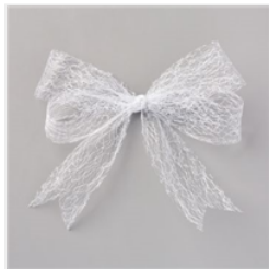
1-1/2" (3.8 Cm) Metallic Mesh Ribbon - 153550