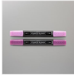
Blackberry Bliss Stampin' Blends Combo Pack - 154877