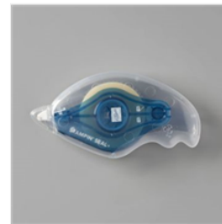
Stampin' Seal+ - 149699