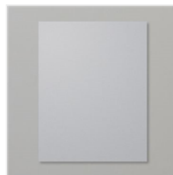
Smoky Slate 8-1/2" X 11" Cardstock - 131202