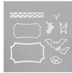
Halloween Magic Dies - 153565