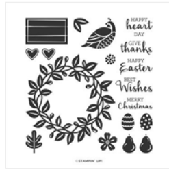
Arrange A Wreath Photopolymer Stamp Set (English) - 152587