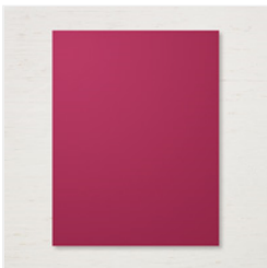
Merry Merlot 8-1/2" X 11" Cardstock - 146979