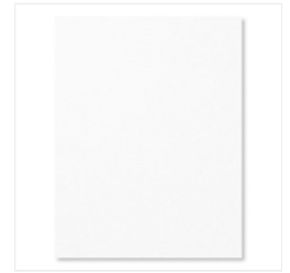
Whisper White 8-1/2" X 11" Cardstock - 100730