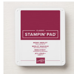
Merry Merlot Classic Stampin' Pad - 147112