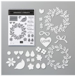
Arrange A Wreath Bundle (English) - 154109

Mary Fish mary@stampinpretty.com http://stampinpretty.com