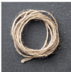
Linen Thread - 104199