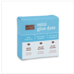
Mini Glue Dots - 103683

Mary Fish mary@stampinpretty.com http://stampinpretty.com