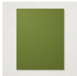
Mossy Meadow 8-1/2" X 11" Cardstock - 133676