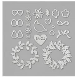
Wreath Builder Dies - 152722