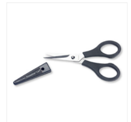
Paper Snips - 103579