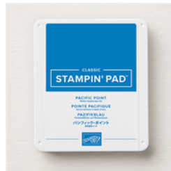
Pacific Point Classic Stampin' Pad - 147098