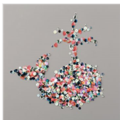
Whale Of A Time Sequins - 152461