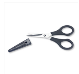
Paper Snips - 103579