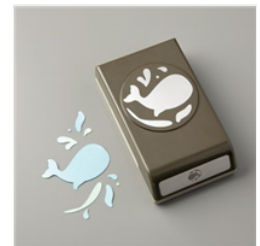
Whale Builder Punch - 152699