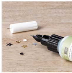
Fine-Tip Glue Pen - 138309