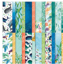
Whale Of A Time 6" X 6" (15.2 X 15.2 Cm) Designer Series Paper - 152460