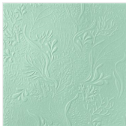
Seabed 3D Embossing Folder - 152700