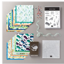
Whale Of A Time Suite Collection (English) - 154126