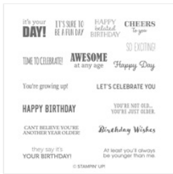
Itty Bitty Birthdays Cling Stamp Set - 148618

Mary Fish mary@stampinpretty.com http://stampinpretty.com