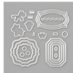
Hippo & Friends Dies - 153585