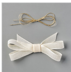
Forever Greenery Trim Combo Pack - 152475