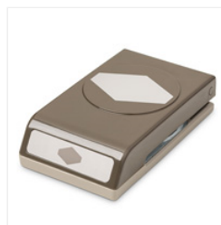
Tailored Tag Punch - 145667