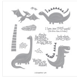
Dino Days Photopolymer Stamp Set - 149406