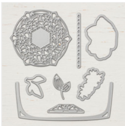
Beautiful Layers Dies - 147043