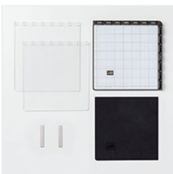
Stamparatus - 146276