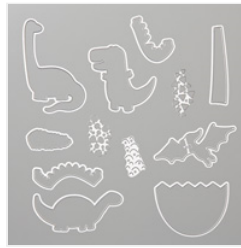
Dino Dies - 149636