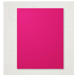
Lovely Lipstick 8-1/2" X 11" Cardstock - 146970