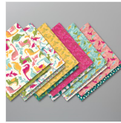
Dinoroar Designer Series Paper - 149589