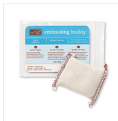
Embossing Buddy - 103083