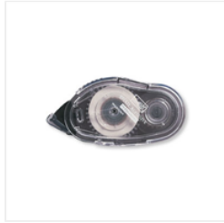
Snail Adhesive - 104332