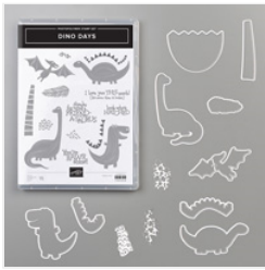
Dino Days Bundle - 151139

Mary Fish mary@stampinpretty.com http://stampinpretty.com