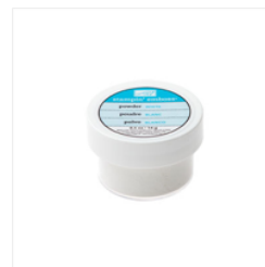
White Stampin' Emboss Powder - 109132