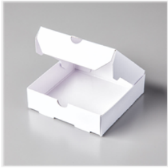
Mini Pizza Boxes - 144645