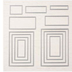
Stitched Rectangle Dies - 148551