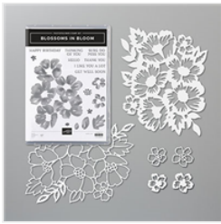
Blossoms In Bloom Bundle (English) - 154123