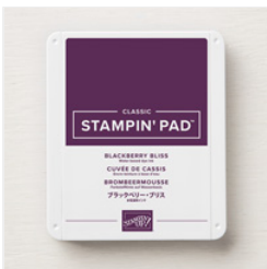
Blackberry Bliss Classic Stampin' Pad - 147092