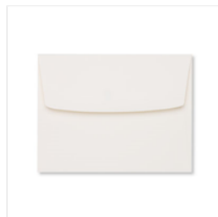
Very Vanilla Medium Envelopes - 107300