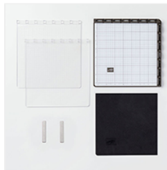
Stamparatus - 146276