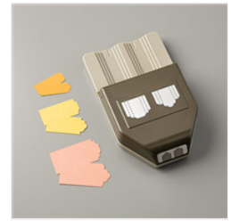
Lovely Labels Pick A Punch - 152883