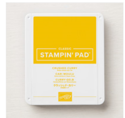
Crushed Curry Classic Stampin' Pad - 147087