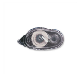
Snail Adhesive - 104332