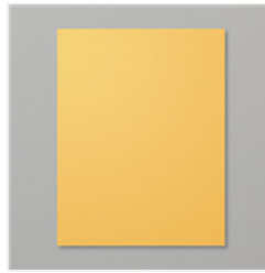
Bumblebee 8-1/2X11 Cardstock - 153077