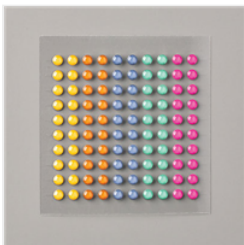
2020-2022 In Color Enamel Dots - 152480