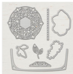
Beautiful Layers Dies - 147043