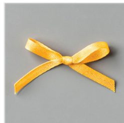
Bumblebee 1/4" (6.4 Mm) 2020-2022 In Color Ribbon - 153622