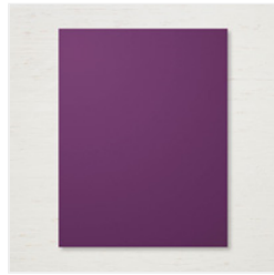
Blackberry Bliss 8-1/2" X 11" Cardstock - 133675