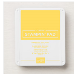
Daffodil Delight Classic Stampin' Pad - 147094