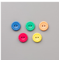
2018-2020 In Color Buttons - 149608