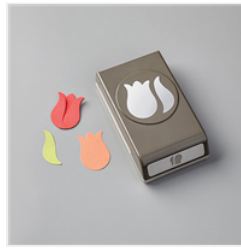
Tulip Builder Punch - 151295