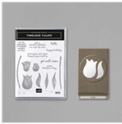
Timeless Tulips Bundle (English) - 153793