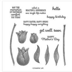
Timeless Tulips Photopolymer Stamp Set (English) - 151534