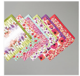
Peaceful Poppies Designer Series Paper - 151324