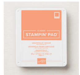
Grapefruit Grove Classic Stampin' Pad - 147142