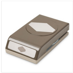
Tailored Tag Punch - 145667

Mary Fish mary@stampinpretty.com http://stampinpretty.com