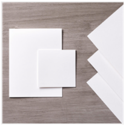
Whisper White 8-1/2" X 11" Thick Cardstock - 140272