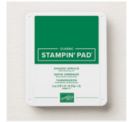
Shaded Spruce Classic Stampin' Pad - 147088