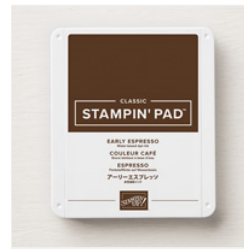
Early Espresso Classic Stampin' Pad - 147114