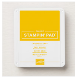
Crushed Curry Classic Stampin' Pad - 147087