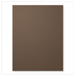
Early Espresso 8-1/2\" X 11\" Cardstock - 119686