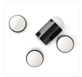
Sponge Daubers - 133773