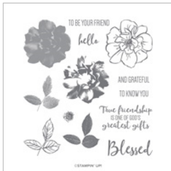
To A Wild Rose Photopolymer Stamp