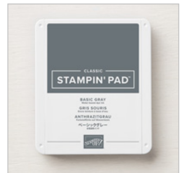
Basic Gray Classic Stampin' Pad