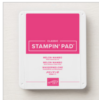
Melon Mambo Classic Stampin' Pad