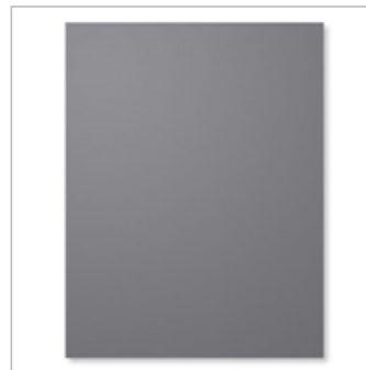
Basic Gray 8-1/2" X 11" Cardstock