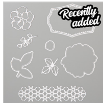
Wild Rose Dies