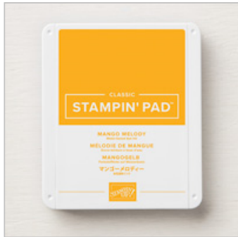
Mango Melody Classic Stampin' Pad