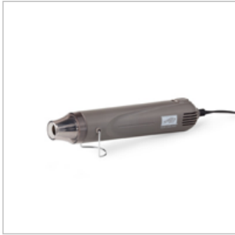
Heat Tool (Us And Canada)