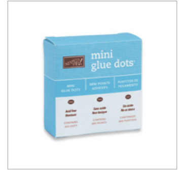
Mini Glue Dots