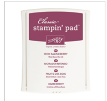
Rich Razzleberry Classic Stampin' Pad