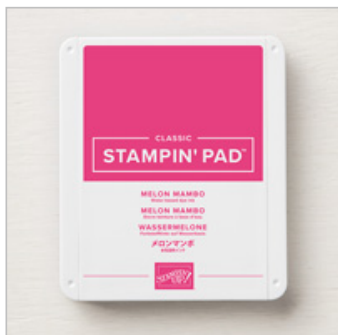
Melon Mambo Classic Stampin' Pad