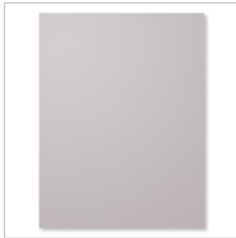
Smoky Slate 8-1/2" X 11" Cardstock