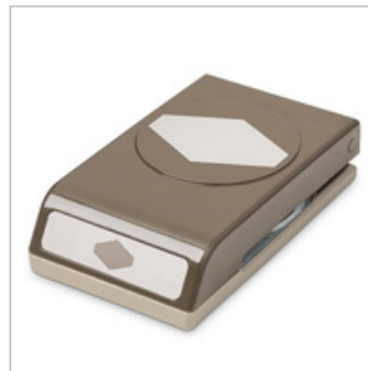
Tailored Tag Punch