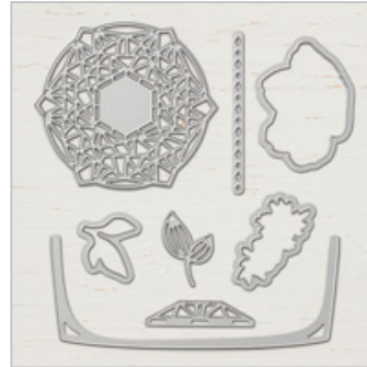
Beautiful Layers Dies