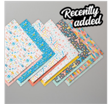
Follow Your Art Designer Series Paper