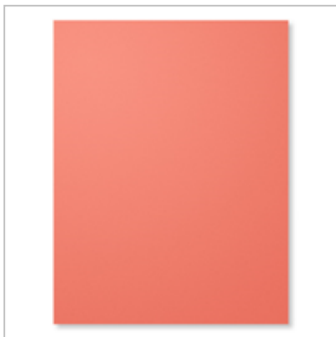
Calypso Coral 8-1/2" X 11" Cardstock