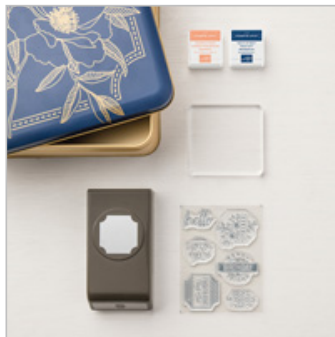
Darling Label Punch Box