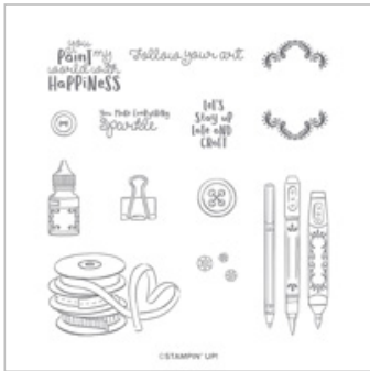
It Starts With Art Cling Stamp Set