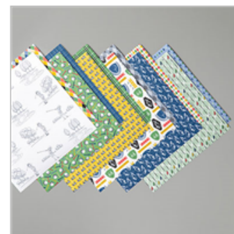
Country Club Designer Series Paper