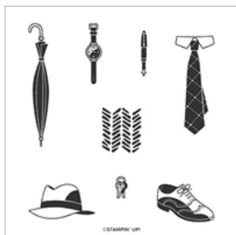
Well Dressed Cling Stamp Set