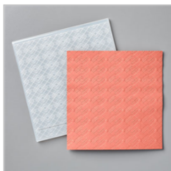
Absolutely Argyle 3D Embossing Folder