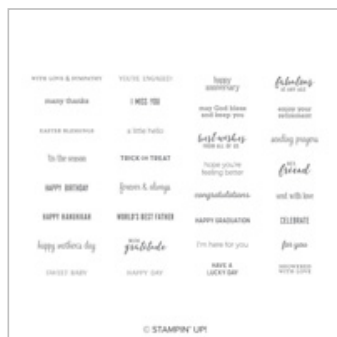
Itty Bitty Greetings Cling-Mount Stamp Set