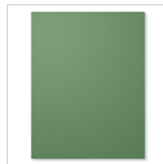
Garden Green 8-1/2" X 11" Cardstock