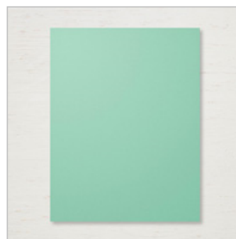
Coastal Cabana 8- 1/2" X 11" Cardstock