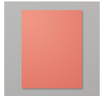
Terracotta Tile 8-1/2" X 11" Cardstock