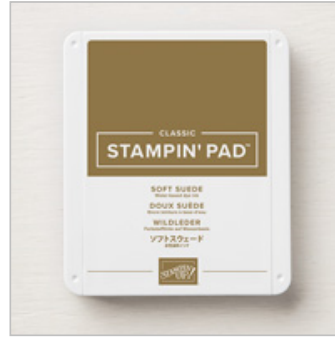
Soft Suede Classic Stampin' Pad