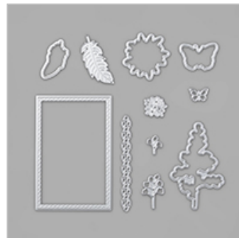
Nature's Thoughts Dies