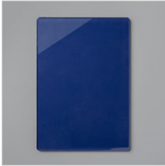
3D Embossing Folder Plate