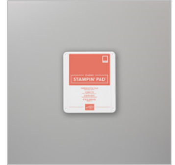
Terracotta Tile Classic Stampin' Pad