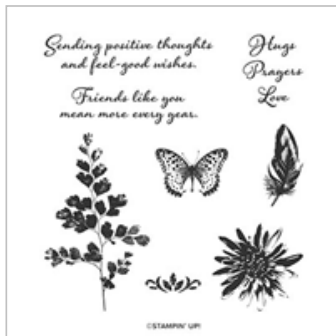
Positive Thoughts Cling Stamp Set