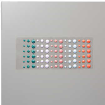
2019-2021 In Color Faceted Dots