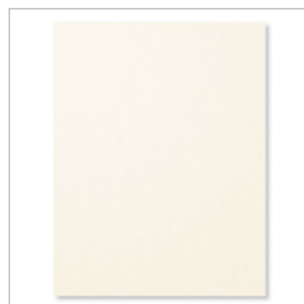
Very Vanilla 8-1/2" X 11" Cardstock