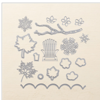
Seasonal Layers Dies