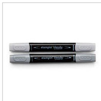
Smoky Slate Stampin' Blends Markers Combo Pack