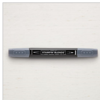
Basic Black Dark Stampin' Blends Marker