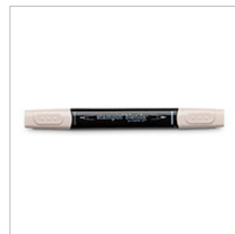
Ivory Stampin' Blends Marker