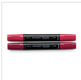
Cherry Cobbler Stampin' Blends Markers Combo Pack