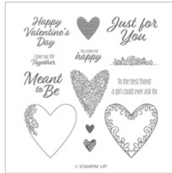
Meant To Be Cling Stamp Set