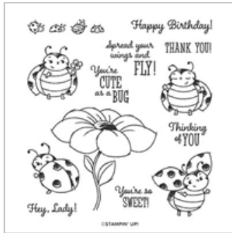
Little Ladybug Host Cling Stamp Set (English)