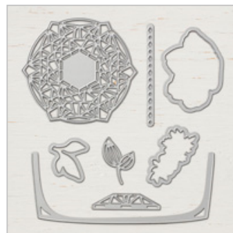
Beautiful Layers Dies