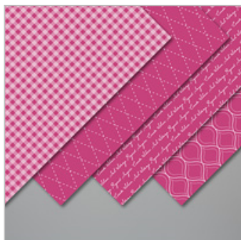
Brights 6" X 6" (15.2 X 15.2 Cm) Designer