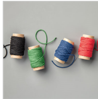
Country Club Twine